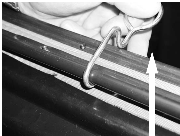
Latch Clip Eyelet