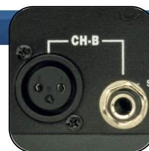
BALANCED XLR & 1/4" INPUTS