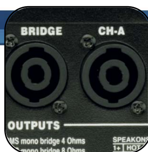
MODERN NEUTRIK OUTPUT CONNECTORS