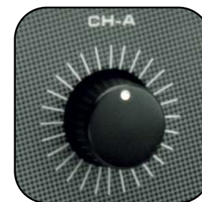
ROTARY VOLUME CONTROLS FOR BOTH CHANNELS