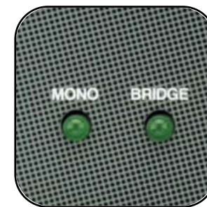
MONO & BRIDGE MODE LEDs