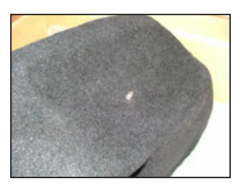
STEP II Unpack Stealthbox<sup>®</sup> and install mounting stud into threaded insert so that 1/2 to 3/4 inch extends from enclosure.

STEP 7 Remove passenger side cargo panel by prying away from side of vehicle and floor.