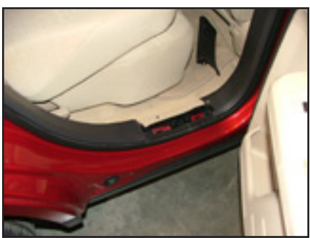
STEP 5 Remove passenger side threshold plate.

releasing two alignment pins at the front edge.