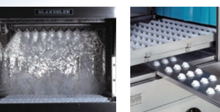
Top and bottom mounted water jets provide torrential cleaning & rinse action.