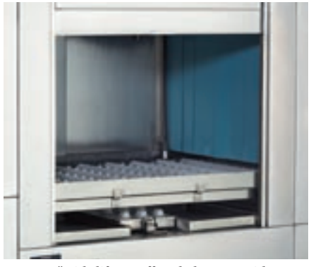
Large 30"wide lift-up/off tank doors provide easy access for tank and component cleaning.