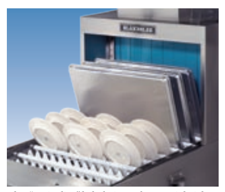
Flat, "no-incline" belt design reduces unit height, simplifies and speeds ware loading.